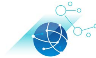
Optimize the Network Edge