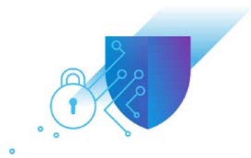
Deliver, Manage & Secure Endpoints